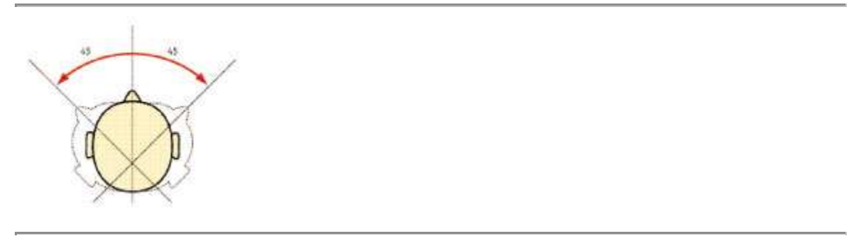
Fig. 5 An ergonomic headrest also provides for axial rotation of the patient's head in the "X" plane.

Most dentists will need to complete skill courses to master access, contacts on instruments, stabilization of the fingers, and views of the operating point.8,9 Headrest design is instrumental in the positioning of the oral cavity for the application of these new skills.