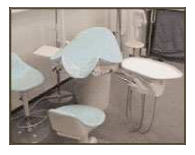
Fig. 6 Type 1: Instruments and tubing supports move with the patient's body.

Type 1.1: Stable type (does not tilt the patient)