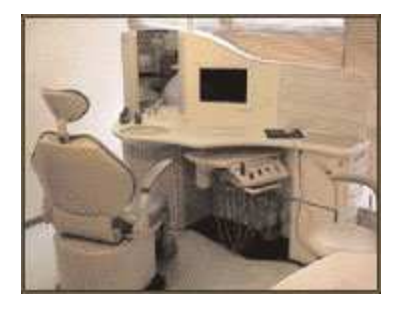
Fig. 8 Type 3: Patient supports and instrument/tubing supports are separate.

Type 3 (Fig. 8): Patient supports and instrument/tubing supports are separate.